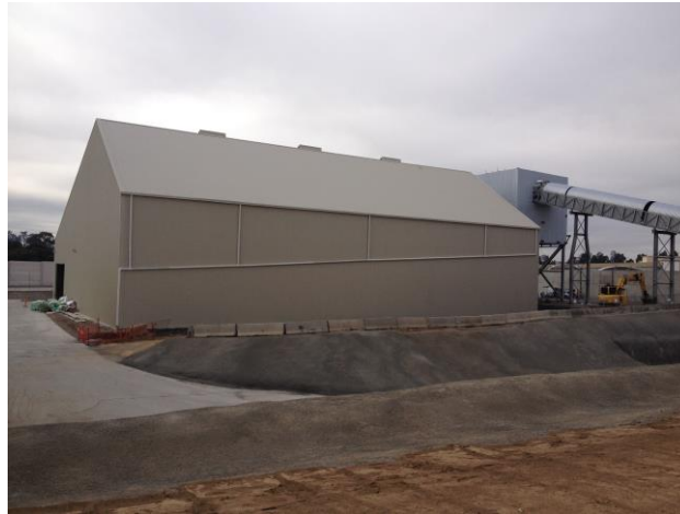
NWRL – Spoil Shed