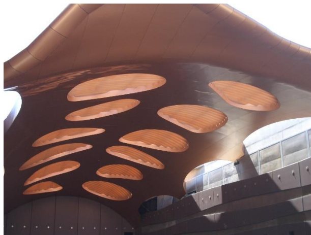
Clem 7 Shafston Canopy