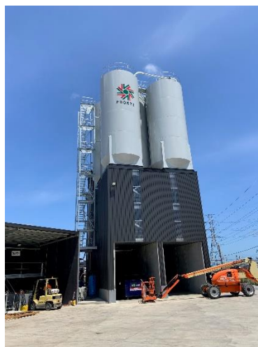
Barro Group - Springvale