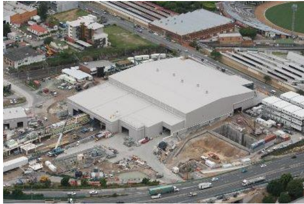
Clem 7 TBM Building