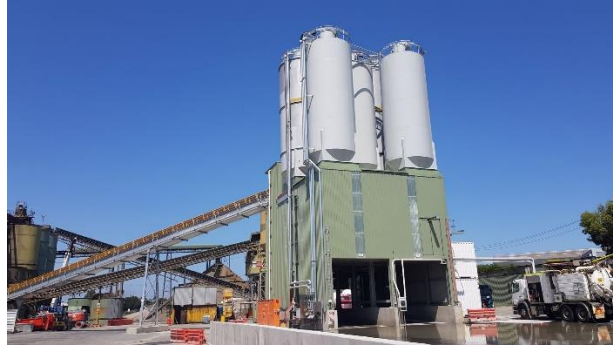
Hanson - Westall