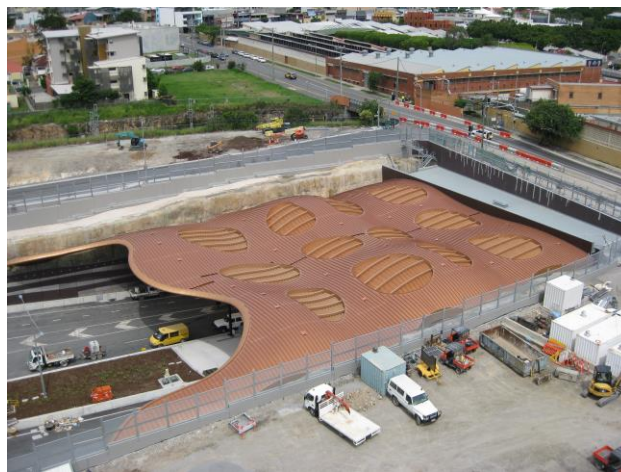
Clem 7 Northern Canopy