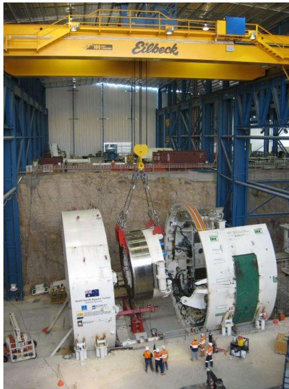
245T Gantry Crane inside Clem 7 Building