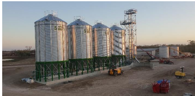
Cleveland Ag - Feedlot