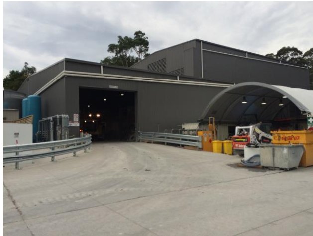
NCX – Northern Interchange Site