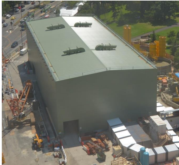
Metro Tunnel – Domain Station